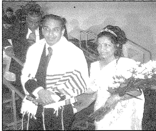
Indian Jewish wedding

In contrast, the right-handed Nazi swastika was misused – to inflame rather than instruct.